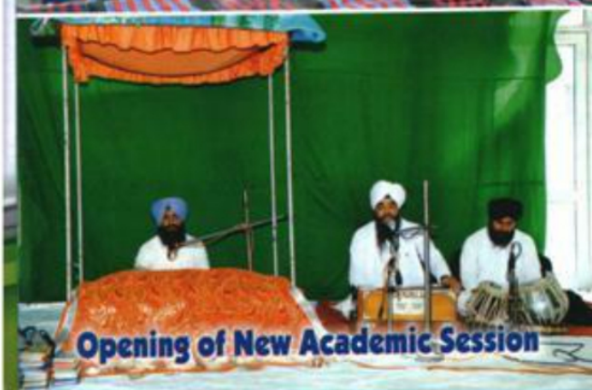
Opening of New Academic Session